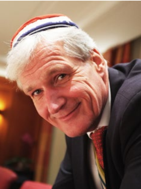
Nicodemus met with Jesus.

As Moses lifted up the serpent in the wilderness, even so must the Son of Man be lifted up, that whoever believes in him should not perish, but have eternal life. For God so loved the world, that he gave his one and only Son, that whoever believes in him should not perish, but have eternal life. For God didn’t send his Son into the world to judge the world, but that the world should be saved through him. He who believes in him is not judged. He who doesn’t believe has been judged already, because he has not believed in the name of the one and only Son of God. This is the judgment, that the light has come into the world, and men loved the darkness rather than the light; for their works were evil. For everyone who does evil hates the light, and doesn’t come to the light, lest his works would be exposed. But he who does the truth comes to the light, that his works may be revealed, that they have been done in God.”