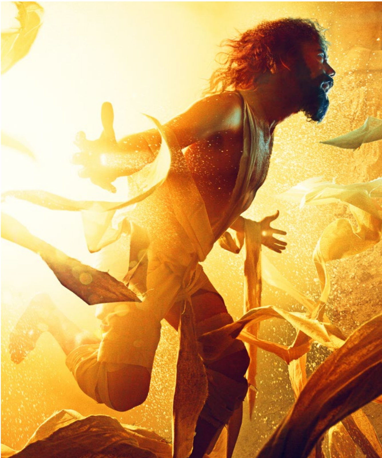
MAGNUS 3D / CREATION SWAP