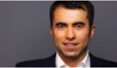
Matthew Alphaeus Reporter

As they came out, they found a man of Cyrene, Simon by name, and they compelled him to go with them, that he might carry his cross. They came to a place called “Golgotha”, that is to say, “The place of a skull.” They gave him sour wine to drink mixed with gall. When he had tasted it, he would not drink. When they had crucified him, they divided his clothing among them, casting lots, and they sat and watched him there. They set up over his head the accusation against him written, “THIS IS JESUS, THE KING OF THE JEWS.” Then there were two robbers crucified with him, one on his right hand and one on the left. Those who passed by blasphemed him, wagging their heads, and saying, “You who destroy the temple, and build it in three days, save yourself! If you are the Son of God, come down from the cross!” Likewise the chief priests also mocking, with the scribes, the Pharisees, and the elders, said, “He saved others, but he can’t save himself. If he is the King of Israel, let him come down from the cross now, and we will believe in him. He trusts in God. Let God deliver him now, if he wants him; for he said, ‘I am the Son of God.’” The robbers also who were crucified with him cast on him the same reproach. Now from the sixth hour there was darkness over all the land until the ninth hour.