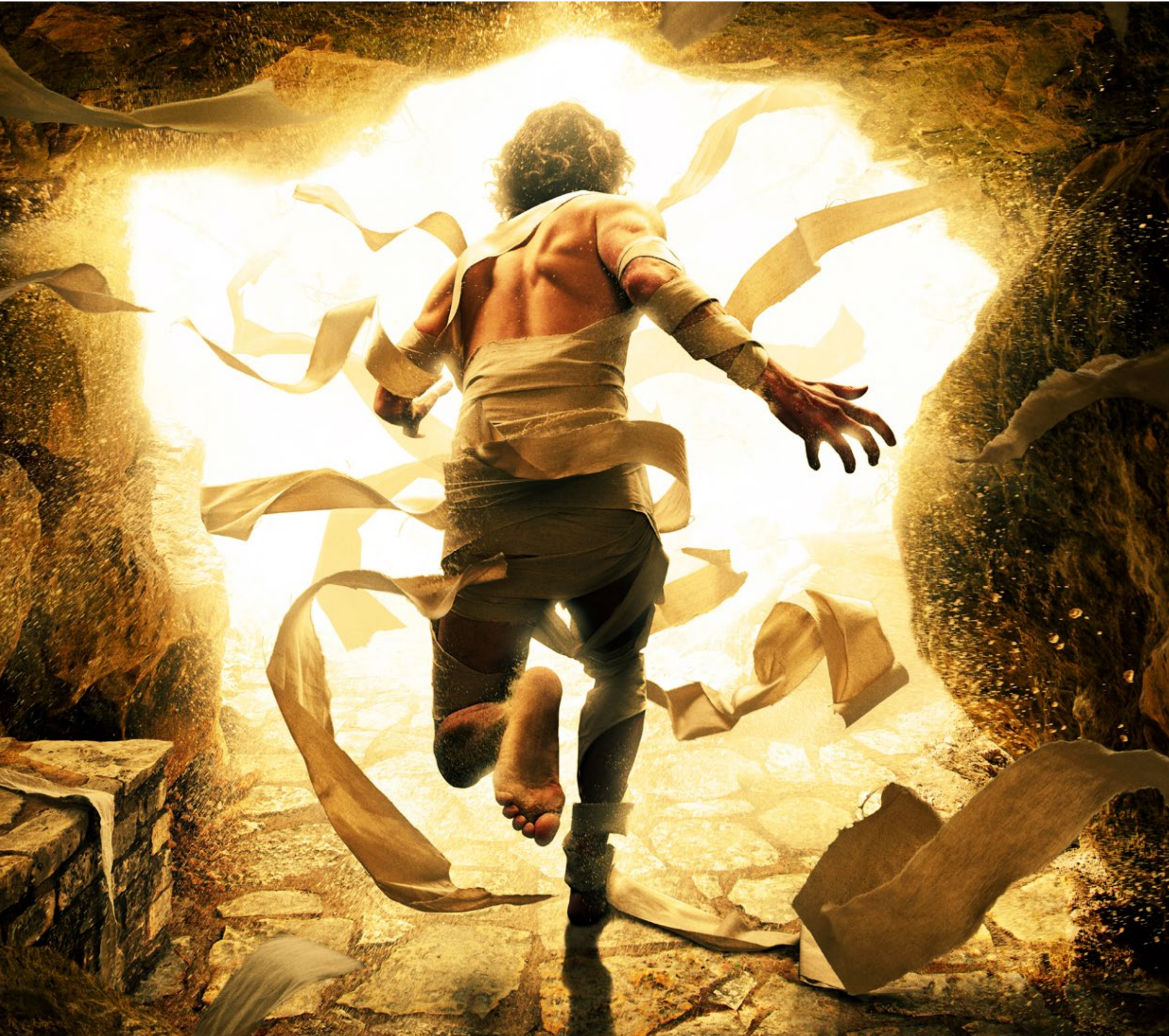
MAGNUS 3D / CREATION SWAP

Jesus cried with a loud voice, “Lazarus, come out!” He who was dead came out bound hand and foot.